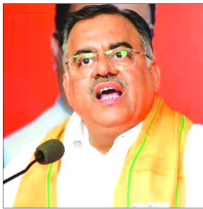
during their rule. The Abdullahs get their agenda to work in J&K from Pakistan and they do whatever their masters in Pakistan desire them to do. "That is why they would never condemn disruptive and violent activities of Pakistan-sponsored terrorists who not only target common people but also use their ammunition against the security forces", Chugh said, asking people of J&K to teach them a lesson during the Lok Sabha elections. Chugh also fired senior Congress SS Channi for insulting the security forces for their action on Pakistan terrorists after the Pulwama incidents. He said the Congress was as much hand in glove with Pakistan forces as the Abdullahs are.

Reacting strongly to the statement of Farooq Abdullah that Pakistan was a nuclear power, Chugh said instead of being proud of India's military power Abdullahs have been playing in the hands of the Pakistan ISI that is why there has been no development in J&K