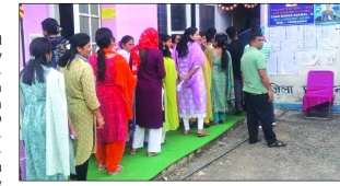
General Elections to Lok Sabha 2024. These innovative polling stations viz: women manned, youth manned, PwD manned,

JAMMU, APR 26 In a first of its kind move towards inclusivity and environmental consciousness, the Election Commission of India (ECI) established 109 remarkable polling stations of different categories for voters in Jammu Parliamentary Constituency (PC) which went for polling today in the second phase of