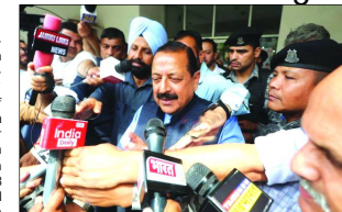
In 2014, the people got a feel of real democracy, especially in Jammu and Kashmir where the grassroots level democracy was strengthened with the holding of panchayat and urban local bodies elections and implementation

JAMMU, APR 26 The people of the country, especially those in Jammu and Kashmir, tasted "real democracy" under the leadership of Prime Minister Narendra Modi, Union Minister Jitendra Singh said on Friday. On a day when voting is underway in 88 constituencies spread across 13 states and Union Territories in the second phase of the Lok Sabha elections, Singh said the BJP will register a "landslide" victory and form a "stable and strong" government for the third consecutive term. "After Modi took over