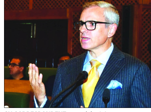
GY CORRESPONDENT SRINAGAR, NOV 6

Jammu and Kashmir Chief Minister Omar Abdullah on Wednesday said the Assembly has done its job after it passed a resolution seeking a dialogue between the Centre and elected representatives for the restoration of the special status of the erstwhile state. The resolution, which also expressed "concern" over the "unilateral removal" of the spe-