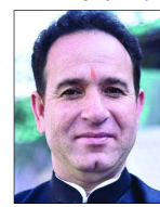
GY CORRESPONDENT SRINAGAR, NOV 06

Opposition BJP on Wednesday said it will not allow the proceedings of the Jammu and Kashmir Assembly to go on until a resolution ask-