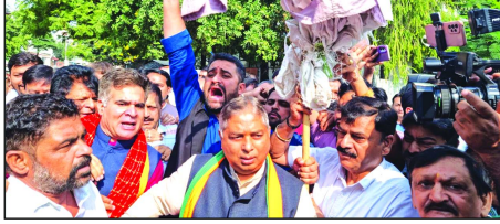
GY CORRESPONDENT JAMMU, NOV 6

BJP strongly protests against the passage of resolution on Article 370 restoration