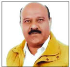
GY CORRESPONDENT SRINAGAR, NOV 6

Says have sought democratic rights, many states given special status then why not J&K